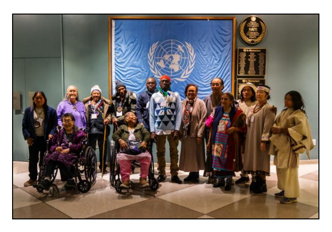
The Elders at the United Nations where they meditated on solutions to implement a more ecological society as well as how to spread this consciousness on a global scale.

The January OneLight gathering hosted a screening of the powerful documentary film The Twelve released by Le Ciel Foundation. We all agreed it was made all the more moving watching together in a good sized group. We plan to show this film again at some point here at Essex Church so that more of our congregation can be touched by the film's inspirational message. There clearly is wisdom all around us, to guide us into more harmonious living with Nature and with one another.