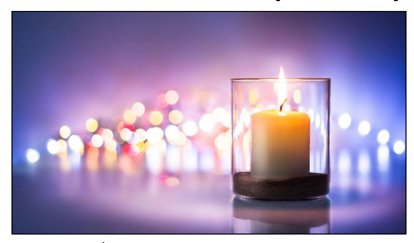
Thursday 30<sup>th</sup> January 6.45 for a 7.00pm start to 8.30pm A shared ritual of darkness and light to honour Imbolc and Candlemas

All welcome and you might like to bring a candle for us to bless. We'll have some spare candles as well. We'll hold a candlelit silence, learn a simple chant, sit in companionable darkness together and speak of that which we are ready to clear out of our lives in order to welcome the new. Please let one of us know if you plan to join us or email eco@kensington-unitarians.org.uk