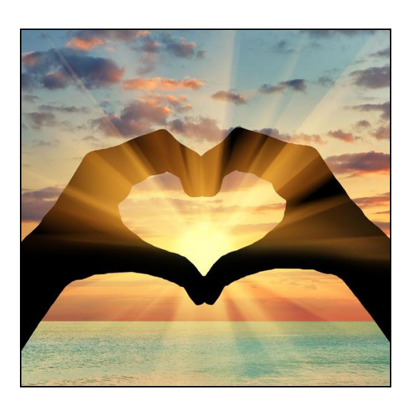
Valentines Night - A Date with Source! Friday 14<sup>th</sup> February, 7 - 8.30pm at Essex Church gathering from 6.50pm – followed by refreshments

On 14th February we'll be on a date with Source! We welcome you, whatever your degree of faith, to join our growing community of spiritual inquirers for events of fellowship, reflection and devotion. These inclusive evenings are skilfully held by a team of trained Interfaith ministers and support people exploring spirituality in an inter-denominational atmosphere. Our gatherings offer song, silence, prayerful circles, space for inner questioning, contemplation and healing; building a generous community spirit in a peaceful setting in central London. With grateful thanks to the Kensington Unitarians congregations for inviting us to use their worship space and for the many inter-connections between our communities.