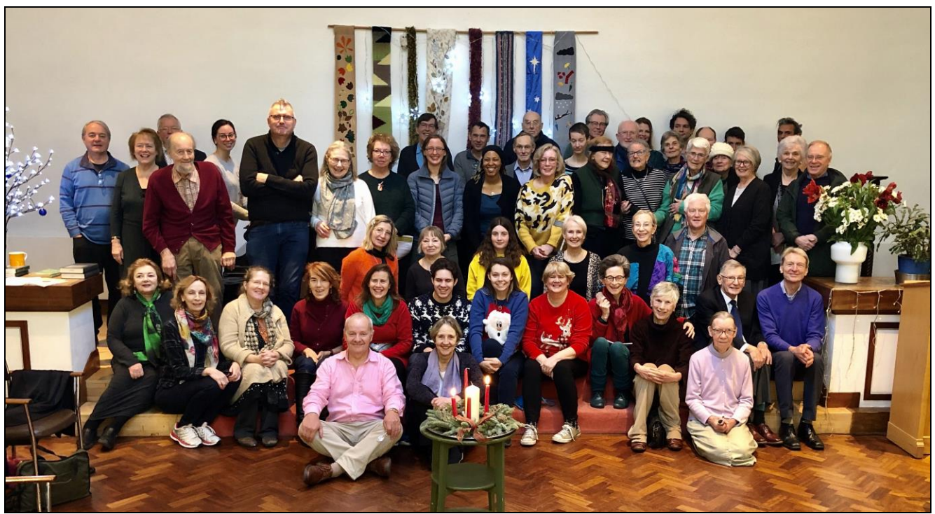
Congregation gathered for our Christmas Carol service and Shared Lunch on Sunday 15th December 2019.