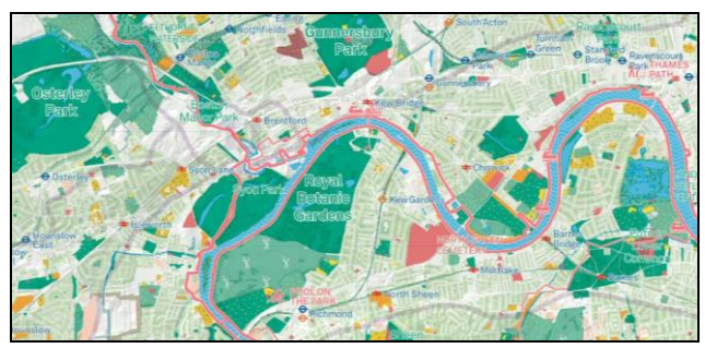
Map available from www.nationalparkcity.london/map

You may have read that London has been declared a National Park City with an aim of improving the quality of life here in our capital. It's hoped that this community based movement will encourage us all to get out into the outdoors and will inspire everyone to help make the city greener, healthier and wilder.