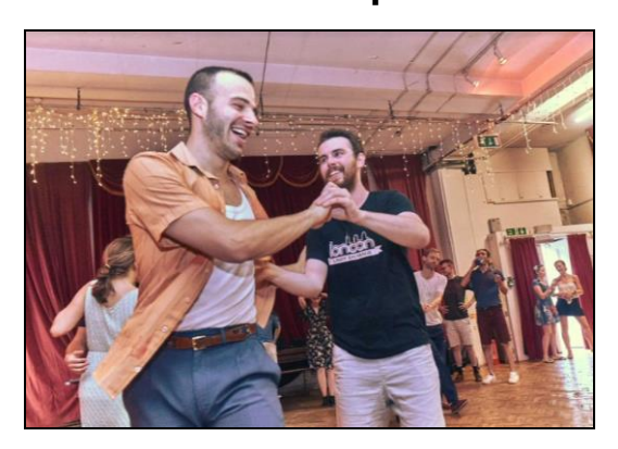
Sunday 1<sup>st</sup> September, 2-5pm Here at Essex Church – Save the Date!

Come and swing dance to support RAICES (www.raicestexas.org), a group working to oppose concentration camps in the US and help immigrants -- including children -- detained at the US border with Mexico.