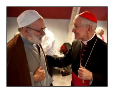
34th World Congress 24<sup>th</sup>-27<sup>th</sup> August 2014 University of Birmingham

At this IARF congress we will consider how the last quartercentury's paradigm-shifting leap in communicative power has shaped the encounter of beliefs, and might inform the ways in which it continues. Contributors will address the advantages that have accrued for the struggle for freedom of belief, as well as the challenges that have arisen for it, from the output of the digital technologies that have revolutionized communication, relationships and identity in recent decades.