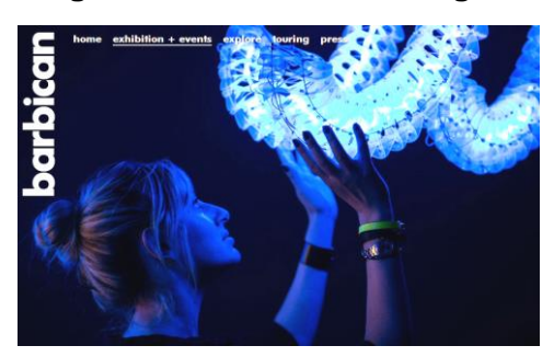
Friday 12<sup>th</sup> September at 6pm Barbican Centre, Silk Street, EC2Y 8DS

An immersive exhibition of art, design, film, music and videogames