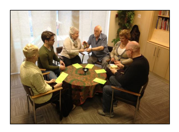
Sundays 10<sup>th</sup> August, 14<sup>th</sup> September at 12.30pm Down in the Church Library

On the second Sunday of each month we hold a small-group communion, after the main morning service, downstairs in the library. These services are led by different members of the congregation. A team of volunteers take turns in leading the services so we can experience a variety of different approaches. The line-up for the next couple of months is as follows: