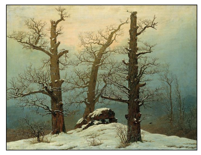
'Time Does Not Rest' - Casper David Friedrich

Even a cursory study of the psychology of seeing reveals that how objects operate as signs and symbols is totally dependent on one's cultural influences and understanding.